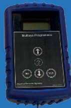
MS103 Handheld Programmer

Each Analyzer can cover 2 zones consisting of 300 meters of fencing each. Designed for deployment on chain link, weldmesh and palisade.