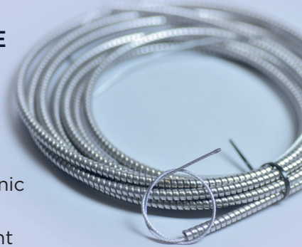
Stainless steel cable conduit

The Flexiguard™ Sensor Cable is Processed inhouse making it the most sensitive Microphonic cable available. Ultra-violet resistant and robust, flexible stainless-steel conduit is also available.